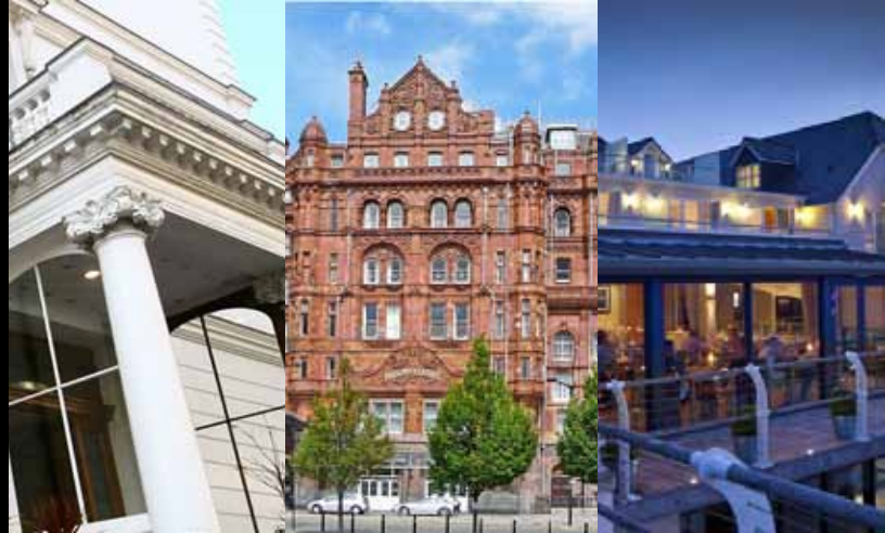
Grange Strathmore Hotel