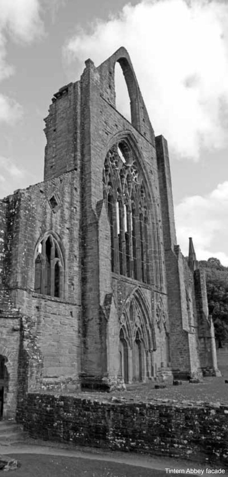
Tintern Abbey facade