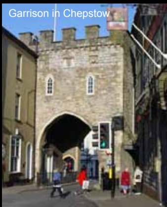
Garrison in Chepstow