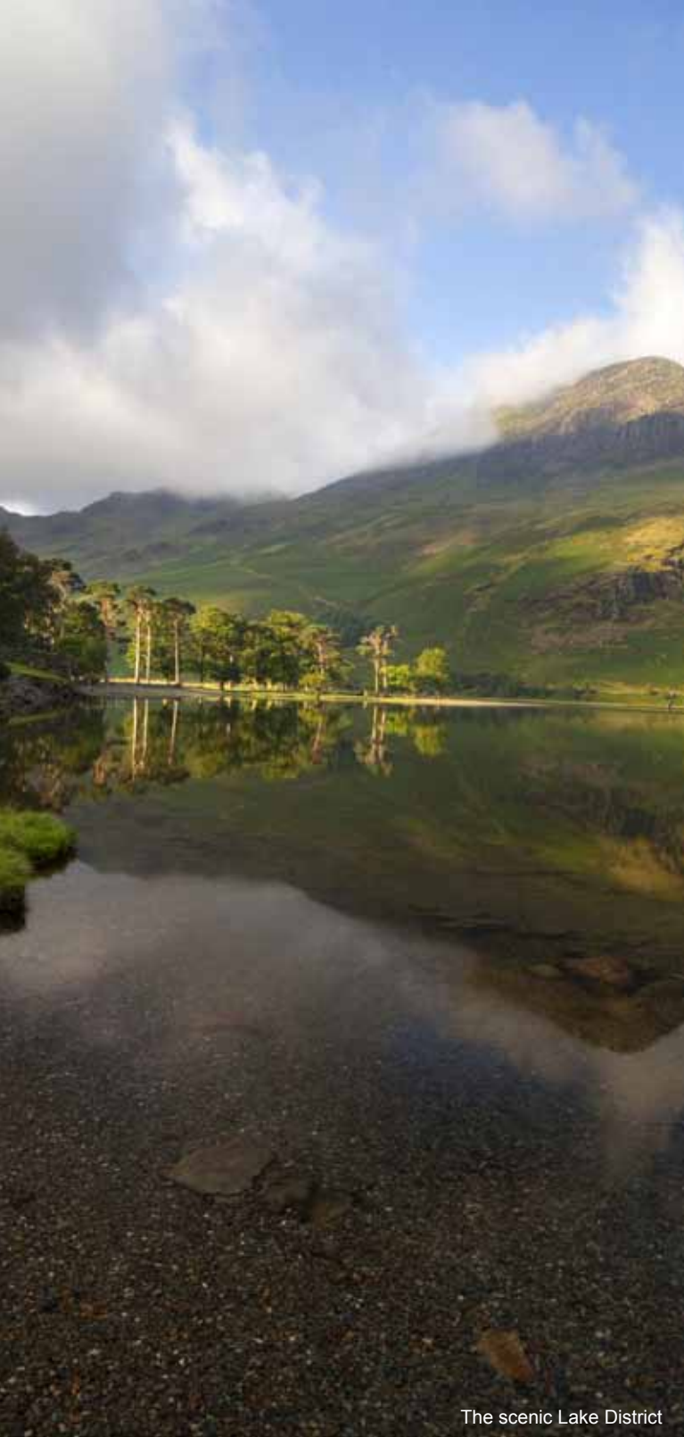
The scenic Lake District