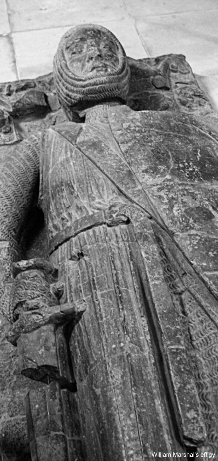
William Marshal's effigy